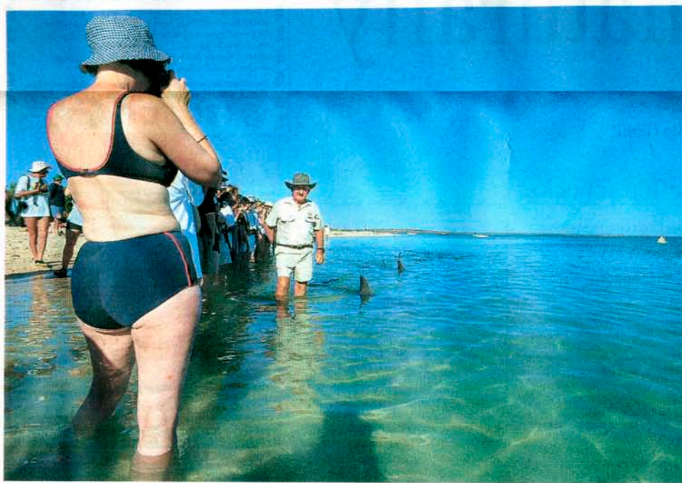
Clockwise from top:

Hot bet: the stalls at Streaky Bay races, South Australia.